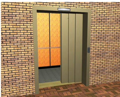
3 SPEED LEFT HAND