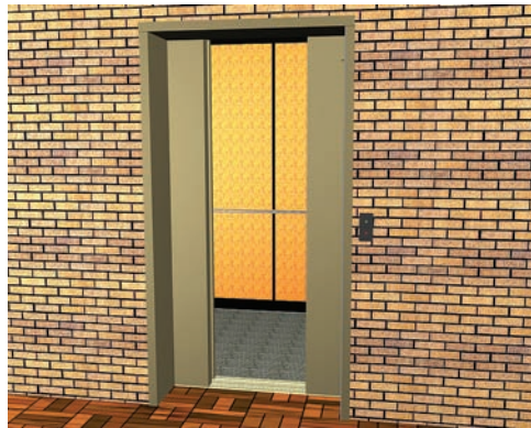
SINGLE SLIDE CENTER OPENING