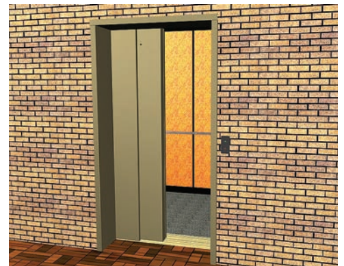
2 SPEED RIGHT HAND