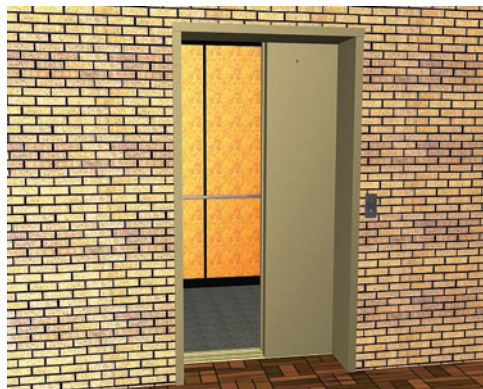
SINGLE SLIDE LEFT HAND