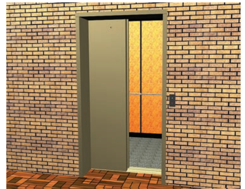
SINGLE SLIDE RIGHT HAND