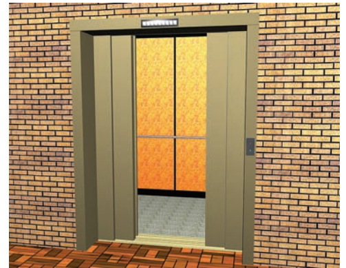
2 SPEED CENTER OPENING