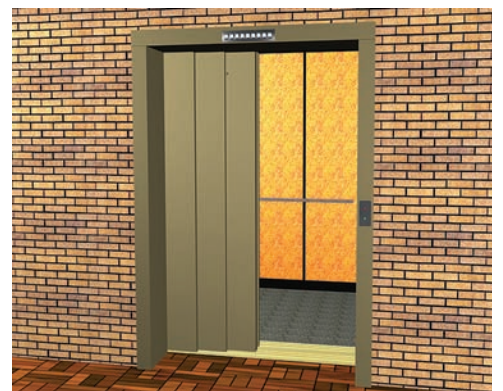
3 SPEED RIGHT HAND